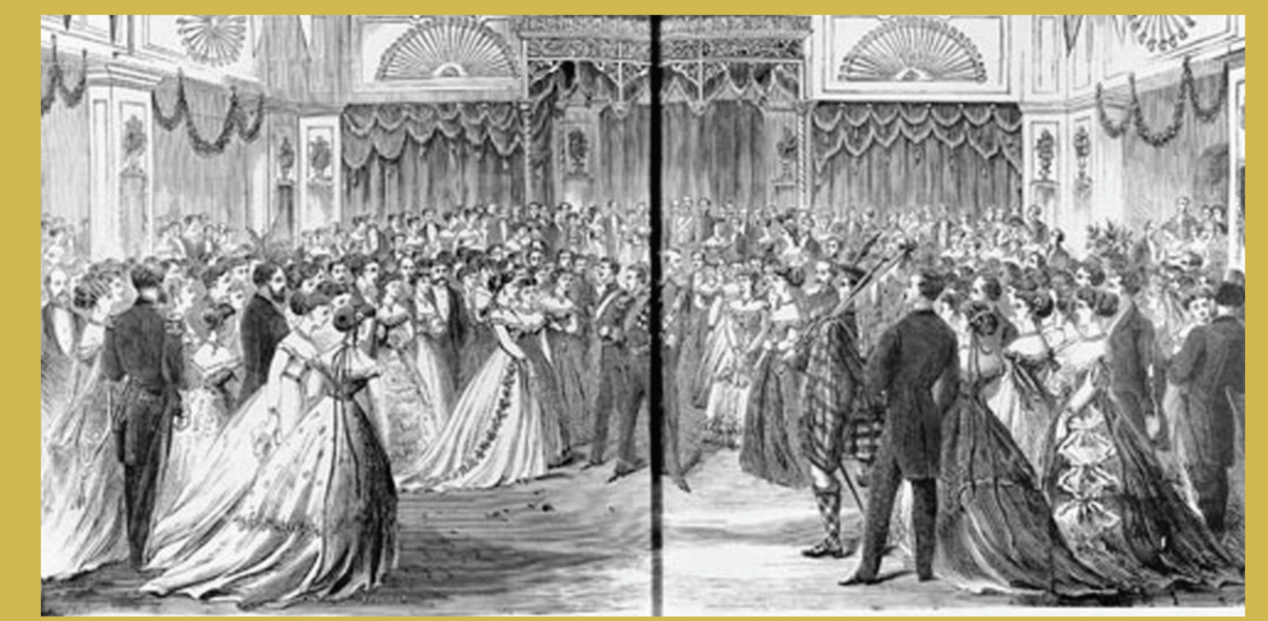
The royal party at the Governors Ball at the Exhibition Buildings, Victoria 1867 A print by Samuel Calvert, 1867.

In Victoria there was a riot at a charity event, at which the Duke was to be the guest of honour; but the most ill-fated event occurred in New South Wales, where a gunman attempted to assassinate the Duke. Though badly injured, the Duke made a full recovery, reportedly being saved by his thick rubber braces which slowed the bullet. Despite these misfortunes the Duke returned to Australia again during a non-official tour in 1869.